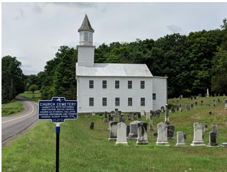
Gallatin Reformed Church, a stop on the Drive Through History "Sacred Spaces" Road Trip.