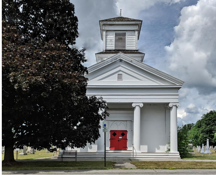
Copake United Methodist Church, a stop on the Drive Through History "Sacred Spaces" Road Trip.