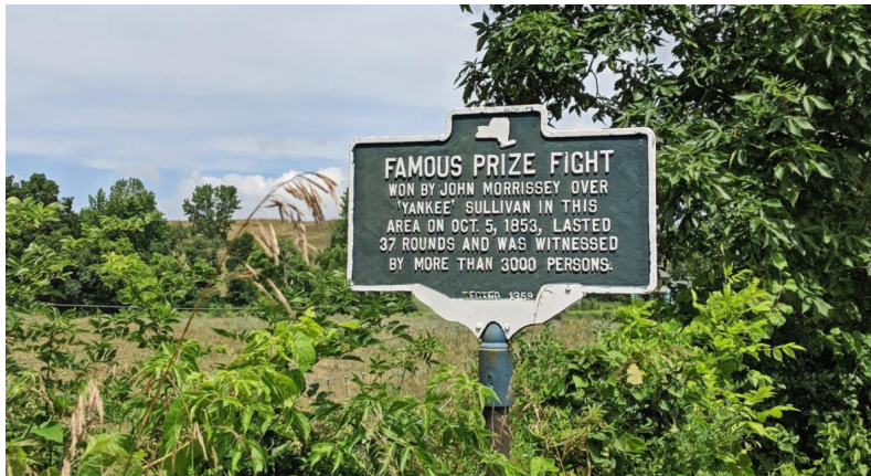
Famous Prize Fight historical marker in Boston Corners, a stop on the Drive Through History "Legends & Folklore" Road Trip.