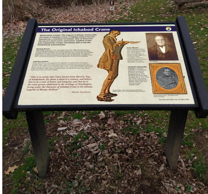
The Original Ichabod Crane