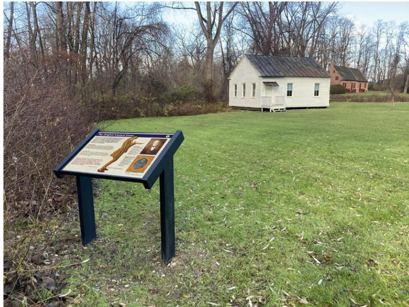
'The Original Ichabod Crane' with the Ichabod Crane Schoolhouse in the background.