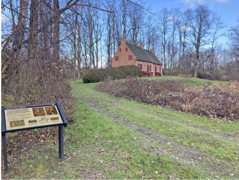
Early Dutch Settlers in the Hudson Valley