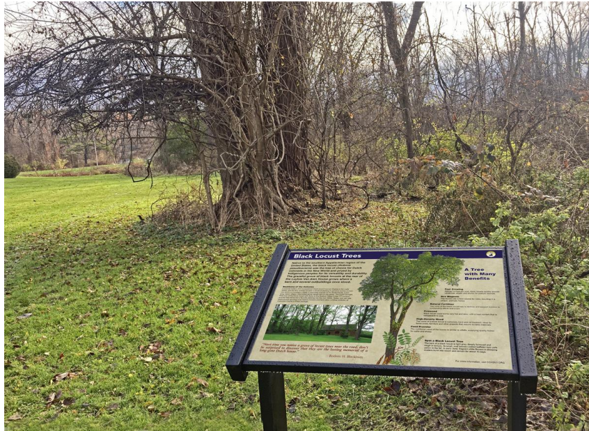
Black Locust Trees Favored by the Dutch Settlers.