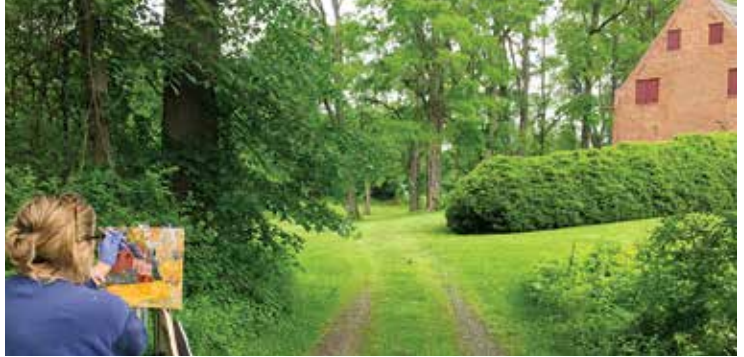
Plein Air at 1737 Luykas Van Alen House